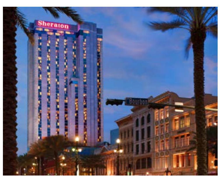
The Sheraton New Orleans Hotel - 2016 AIB Conference Venue

Remember, you will have to identify the track(s) for which you would like to review papers. Descriptions of this year's tracks and identifying keywords and phrases can be found in the paper call; please refer to the detailed paper call.